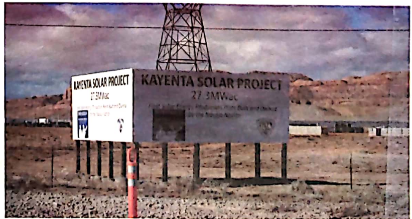
Kayenta, Ariz. Kayenta Solar Project displayed at the front of the entrance at U.S. HWY #163.